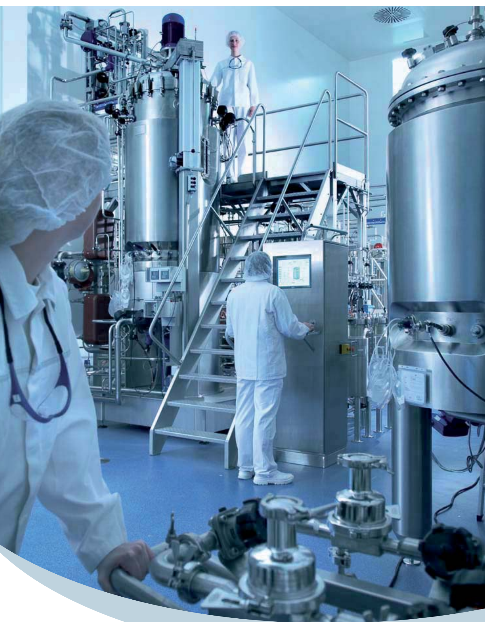
1500 L fermenter for microbial production in Bovenau